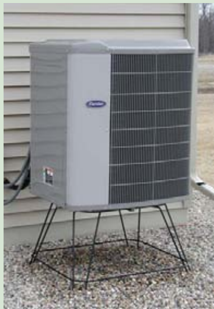
As with a geothermal system, an air-to-air heat pump uses small amounts of electric energy to move much larger amounts of heat energy into the home. It also serves as a cooling system, as the operation can be reversed in the summer to provide air conditioning.

The main difference in the two types of systems is that air-to-air heat pumps generally have a lower installation cost, while geothermal heat pumps usually operate at a higher efficiency, particularly during the coldest part of the winter. Your local cooperative or municipal can help you determine a system well-suited for your situation.