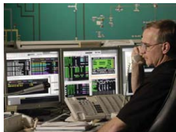
The Minnkota Power Cooperative energy control center is the heart of the load management system. Here, electrical demand is monitored 24 hours a day, 365 days a year. Utilizing the load management system enables customers to enjoy some of the lowest electric rates in the nation.

The ability to interrupt the flow of electricity to the electric portion of the off-peak systems allows Minnkota to operate its generating plants more efficiently and avoid costly power pool purchases. These savings are passed on to customers through the low off-peak electric rate.