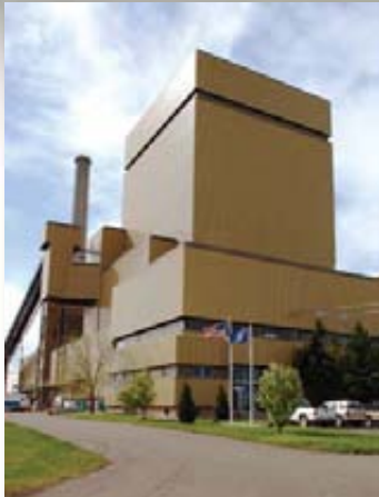
Two lignite-fired generation facilities – the Milton R. Young Station near Center, N.D. (top photo), and the Coyote Station near Beulah, N.D. – are the primary sources of generation for Minnkota.